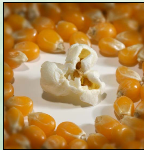
In Search of Perfect Popcorn

What follows is not my original Stat-Teaser article on microwave popcorn in the Winter of 1993, but rather a revised excerpt* of a contemporaneous article published by PI Quality magazine. This article inspired a reviewer at a UK magazine, Quality News, to say that "the use of a popular and essentially highly control-